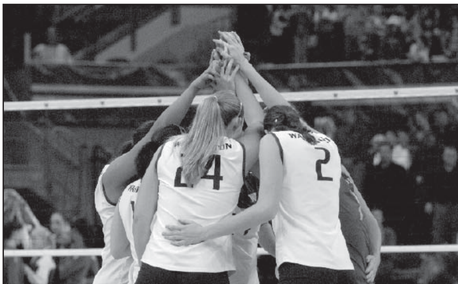
Washington will host the 2008 NCAA Regionals Dec. 12-13

Seattle has been chosen as a host site for the NCAA Regionals, to be held at the Bank of America Arena on Dec. 12-13. Washington has twice before hosted the NCAA Regional round, in 2004 and 2006. Both times the Huskies have hosted the Regional tournament, they advanced to the Final Four. The 2008 NCAA Championships will be held in Omaha, Neb., Dec. 18-20.